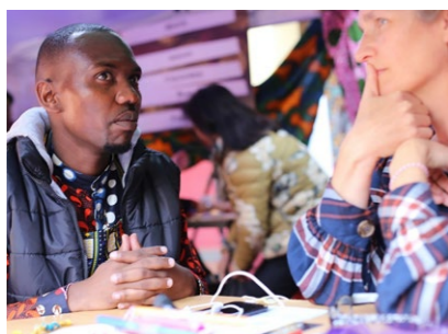
A pop-up story salon in Cape Town created an opportunity for anyone to listen to different stories of people's experiences of being at home, and to have a meaningful conversation about their own reactions.