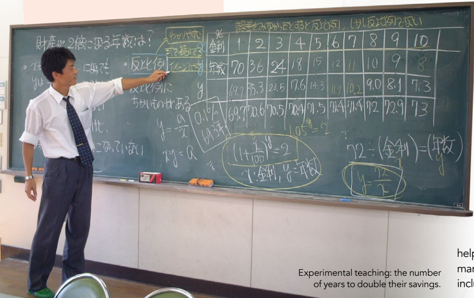
Experimental teaching: the number of years to double their savings.

In the third category, students assume a societal viewpoint and refer to a specific context, such as how mathematics can help a particular company reduce its manufacturing costs, but they do not include a general context.