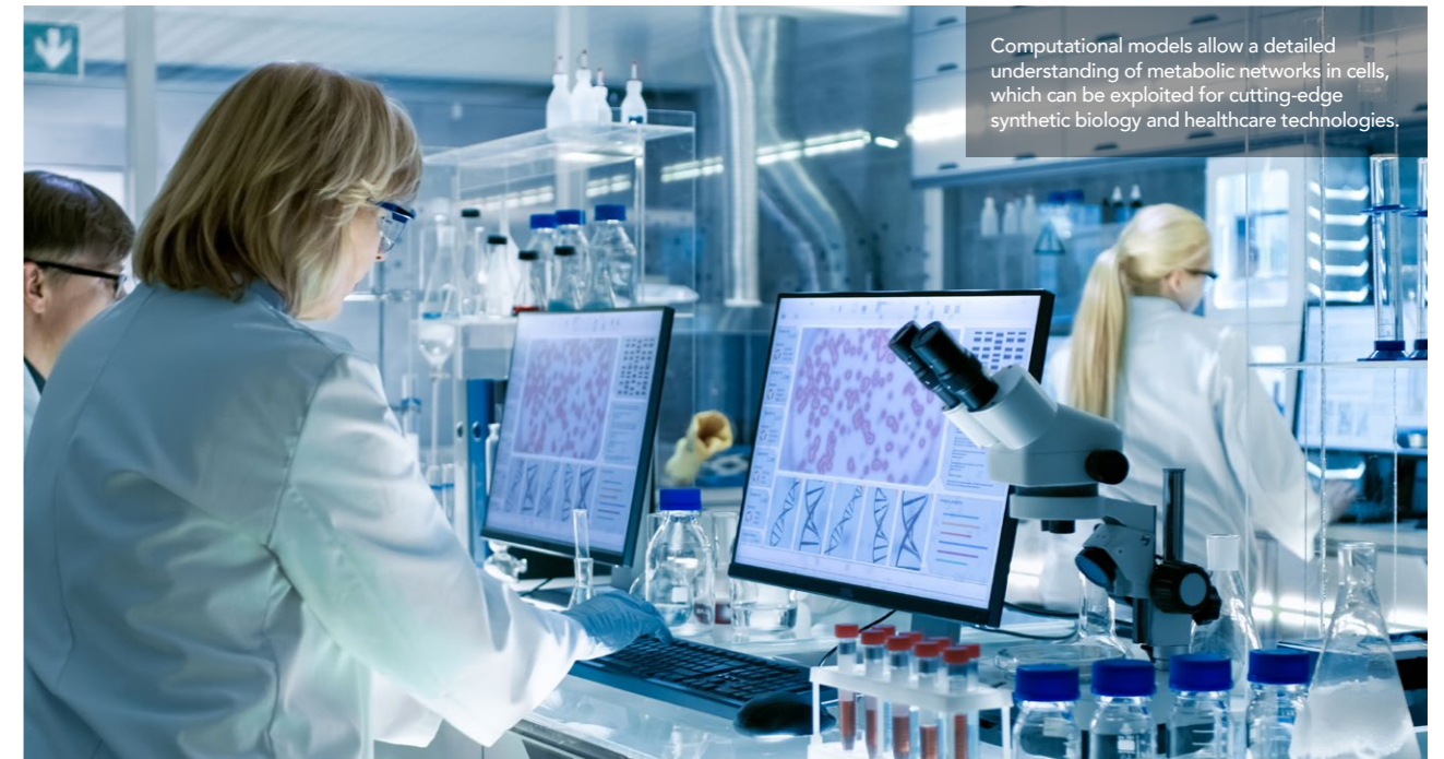
Computational models allow a detailed understanding of metabolic networks in cells, which can be exploited for cutting-edge synthetic biology and healthcare technologies.

The long term ambition of this work is to develop a predictive theory of how complex regulatory networks shape the metabolic response of cells to the environment. Such a theory is the key to understand how cells self-regulate in response to external perturbations,