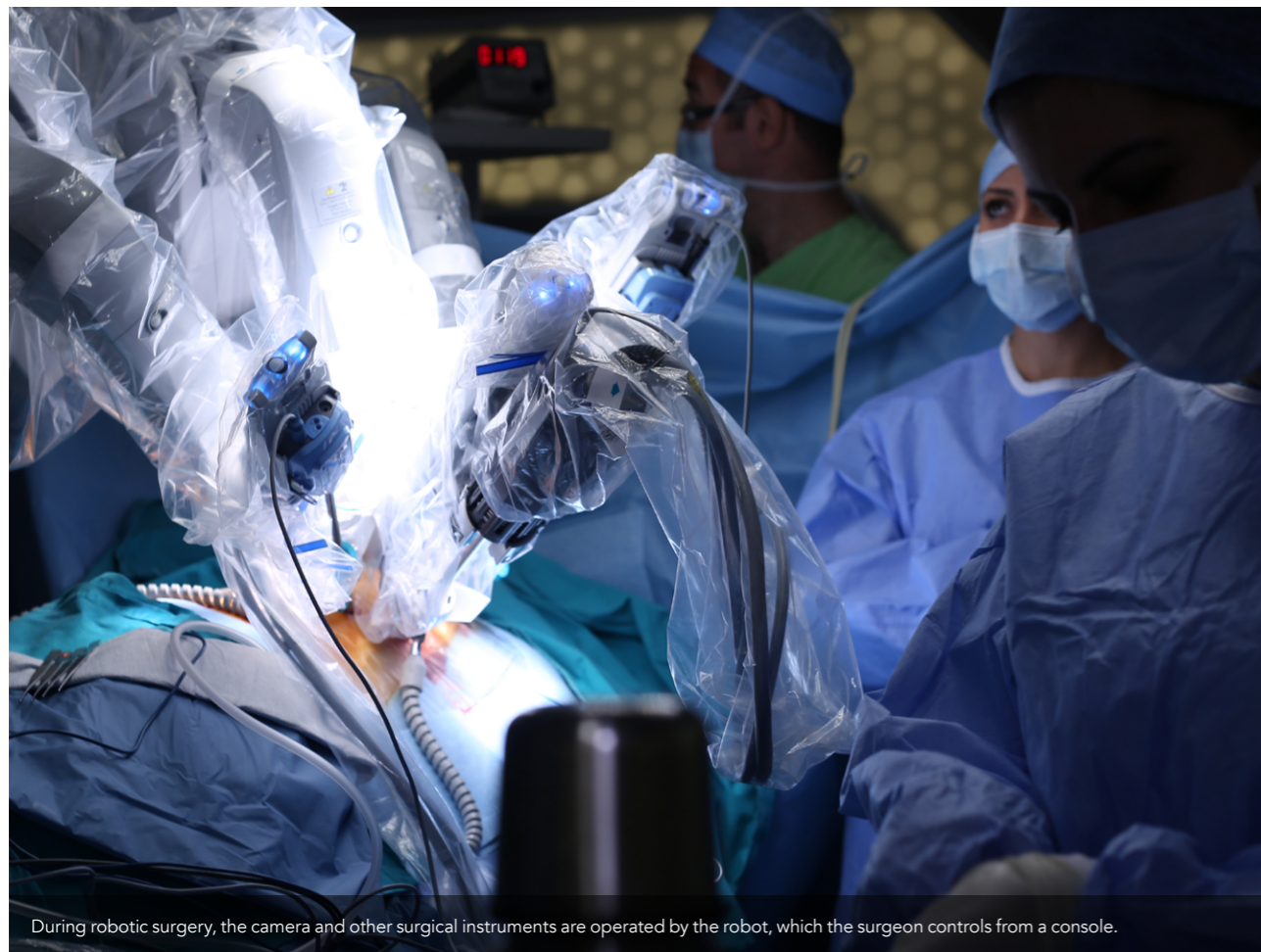
During robotic surgery, the camera and other surgical instruments are operated by the robot, which the surgeon controls from a console.

pain, and needed less pain relief, than other patients.