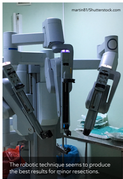
The robotic technique seems to produce the best results for minor resections.

While the robotic technique seems to produce the best results for minor resections, in this study all MILR