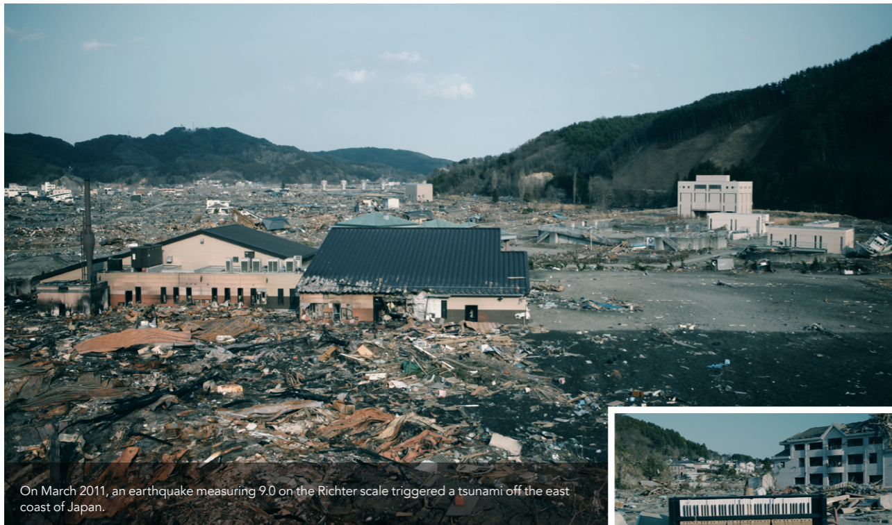
On March 2011, an earthquake measuring 9.0 on the Richter scale triggered a tsunami off the east coast of Japan.