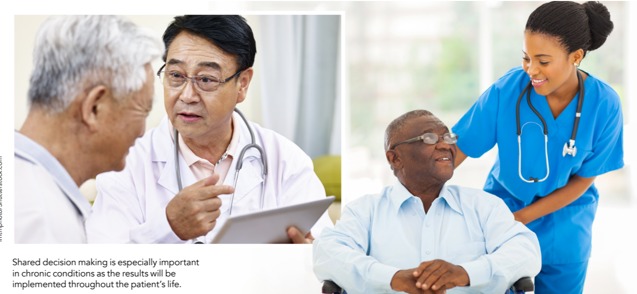
Shared decision making is especially important in chronic conditions as the results will be implemented throughout the patient's life.