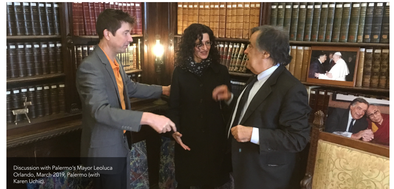
Discussion with Palermo's Mayor Leoluca Orlando, March 2019, Palermo (with Karen Uchic).

Acknowledging that the traditions are equally important and not mutually exclusive, Bauder and Juffs distinguish between traditions which adopt a viewpoint which either follows or rejects the thinking of the Enlightenment (the 17th and 18th century philosophical movement which emphasised reason and individualism rather than tradition). Academics who follow "Enlightenment thinking" associate solidarity with concepts such as free-will, self-responsibility and autonomous decision-making, as propounded by philosophers such as Hobbes, Hume, Kant and Hegel.