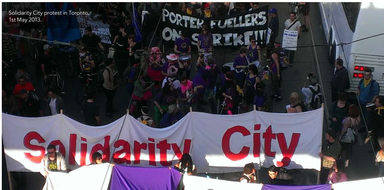
Solidarity City protest in Toronto, 1st May 2013.

policies, they have also provided access to education, health and housing services for migrants and refugees.