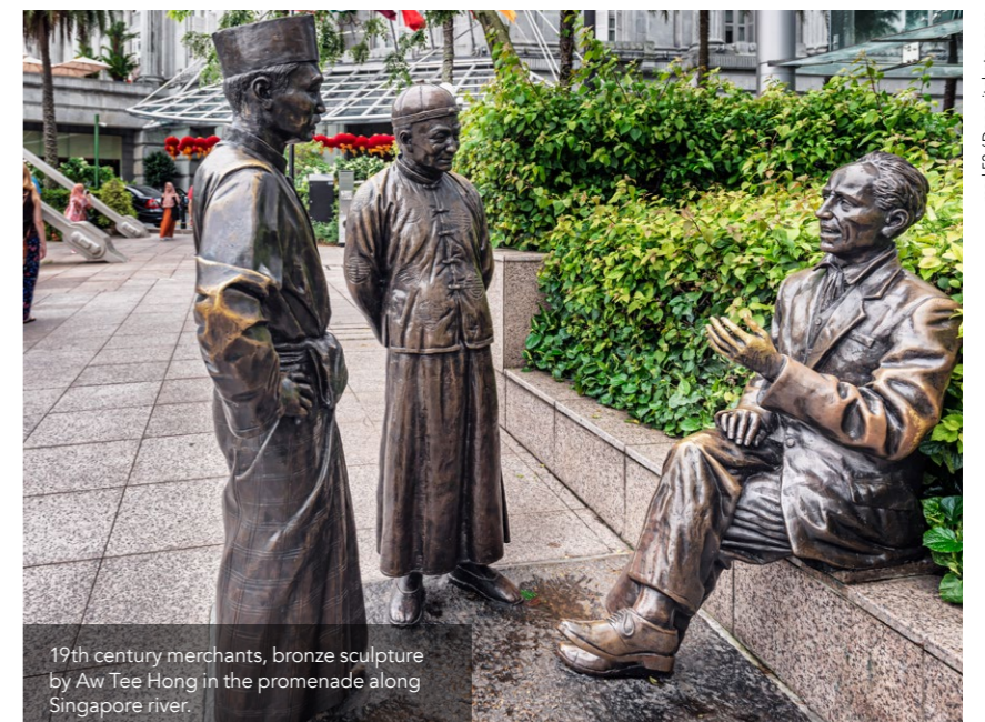
19th century merchants, bronze sculpture by Aw Tee Hong in the promenade along Singapore river.

The Silk Road brought economic advantage... but also spread ideas and beliefs, and Hinduism, Buddhism, Christianity and Islam were all carried along with trade goods.