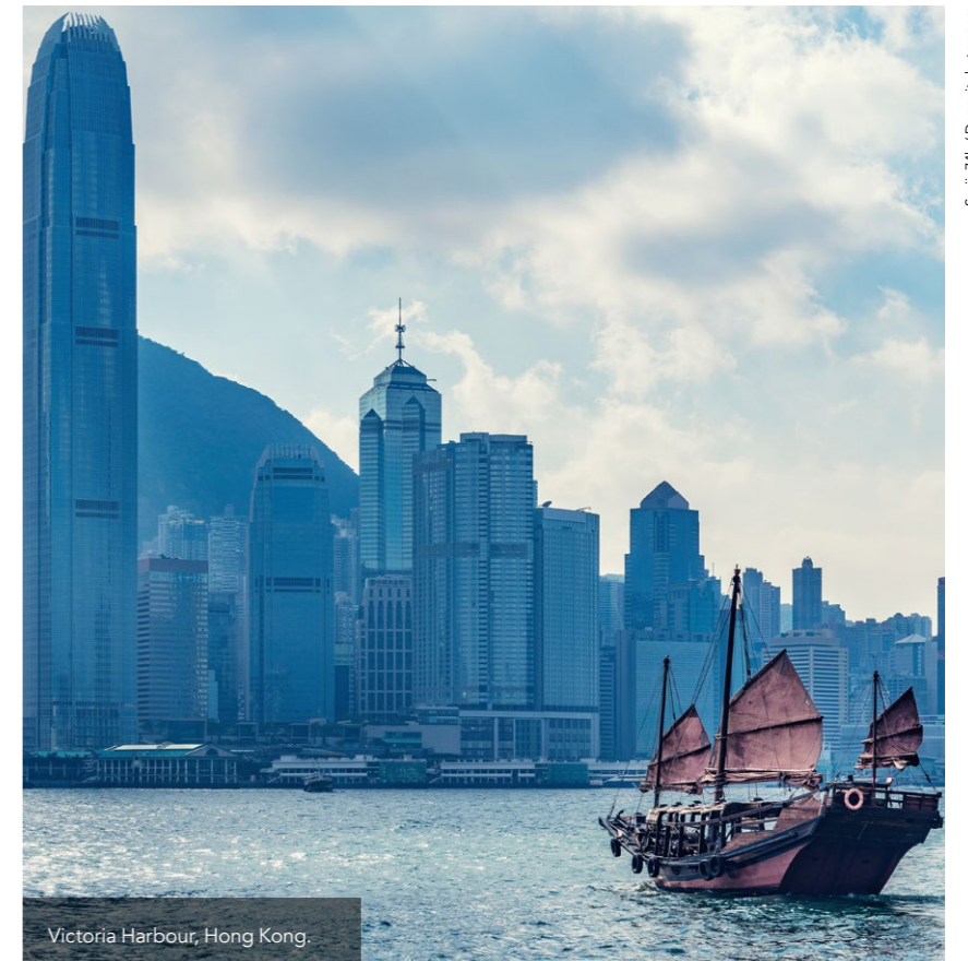
Victoria Harbour, Hong Kong.

He compares this with the actions of Sultan Hussain Shah from whom the British "paid off" for the lands where Singapore was founded. He and his Prime Minister were given a monthly allowance which led him to succumb to the pleasures of wealth and gluttony and grew indifferent to the financial and social welfare of his subjects. The Sultan degenerated into a morally-corrupt individual who would be considered today a violent sexual offender, and was so self-centred that he sold his descendant's legacy to the British. The British, he goes on, later encouraged people to grow rice surrounding the new colony of Malacca which allowed many common people, with hard work, to become