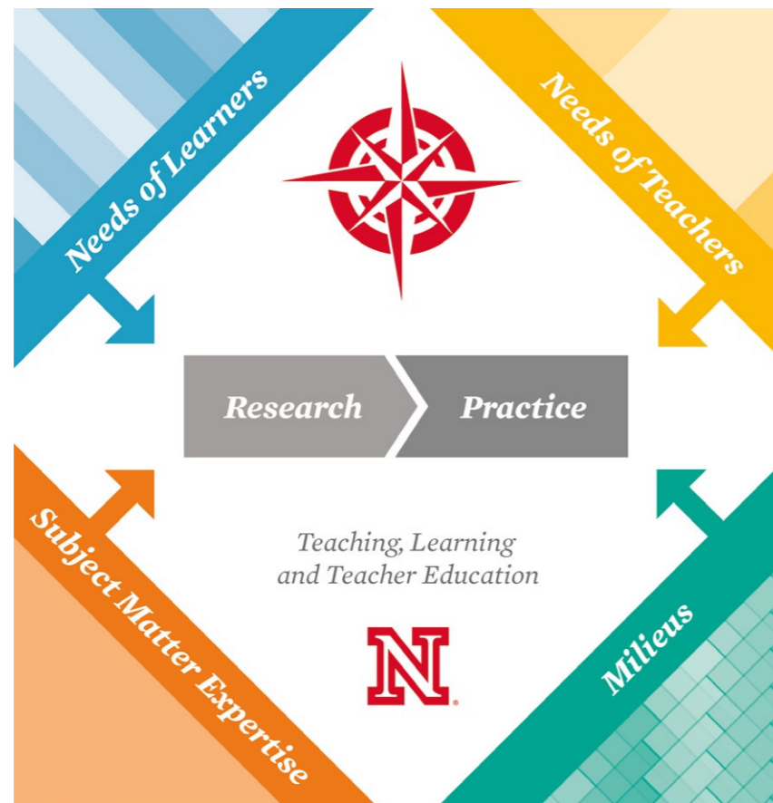
Curriculum Features of Effective Pedagogy (based on the work of curriculum theorist Joseph J. Schwab).