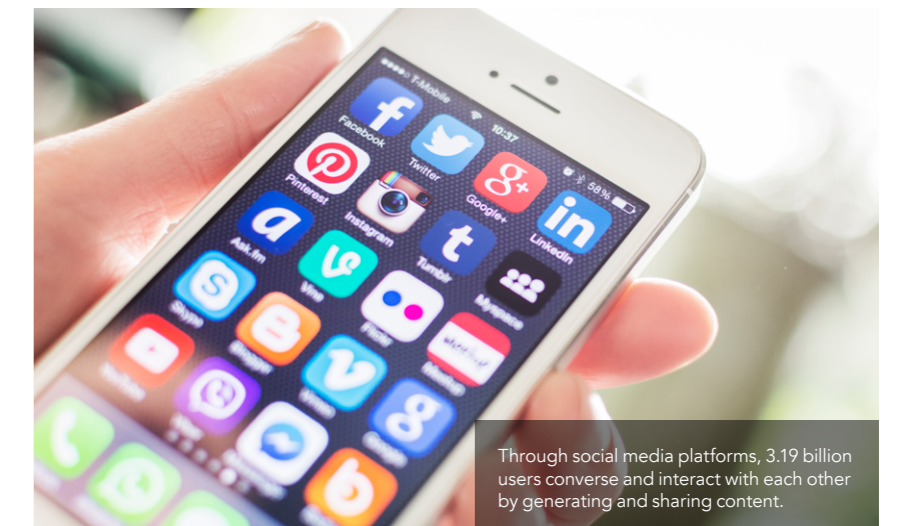
Through social media platforms, 3.19 billion users converse and interact with each other by generating and sharing content.

of a particular race, sexual orientation or gender identity is outlawed in most countries, including the USA. Many countries also agree that hate speech that is degrading of groups of people should also be prohibited ("the degrading of groups" principle), because it undermines their status as free and equal members of society. Again, many countries, but notably not the USA, prohibit such forms of hate