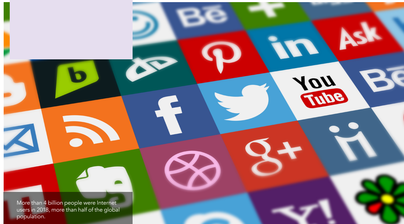
More than 4 billion people were Internet users in 2018, more than half of the global population.

Through social media platforms (such as Facebook, Twitter, YouTube, Instagram and Snapchat), 3.19 billion users converse and interact with each other by generating and sharing content. The business model of most social media companies is built on drawing attention, and given that offensive speech often attracts attention, it can become more audible on social media than it might on traditional mass media. Given the growing problem of offensive and harmful speech online, many countries are asking themselves the challenging question whether they should regulate