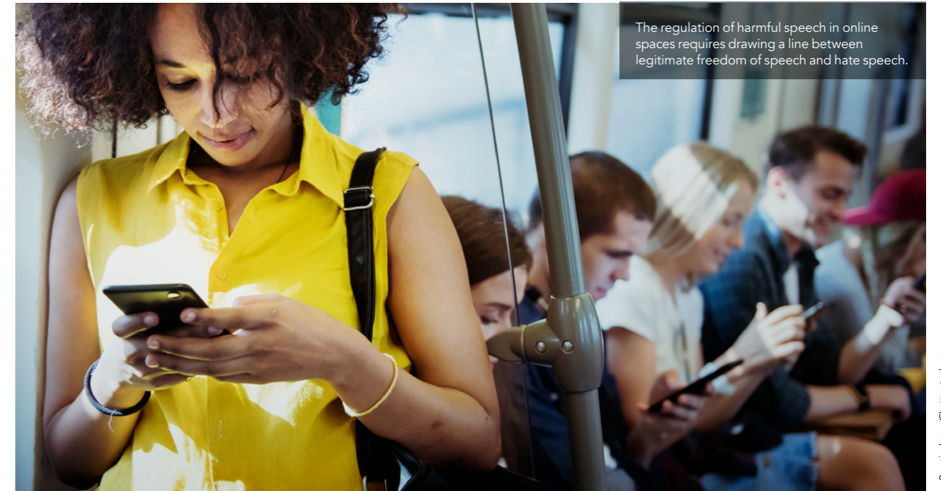
The regulation of harmful speech in online spaces requires drawing a line between legitimate freedom of speech and hate speech.