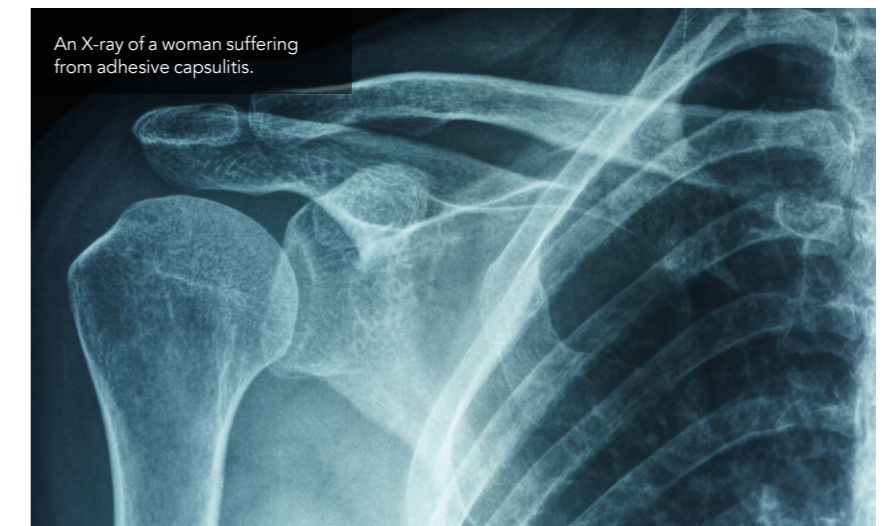
An X-ray of a woman suffering from adhesive capsulitis.

Painful musculoskeletal conditions, such as those affecting the shoulder are highly prevalent in the community and are associated with significant disability and health burden.