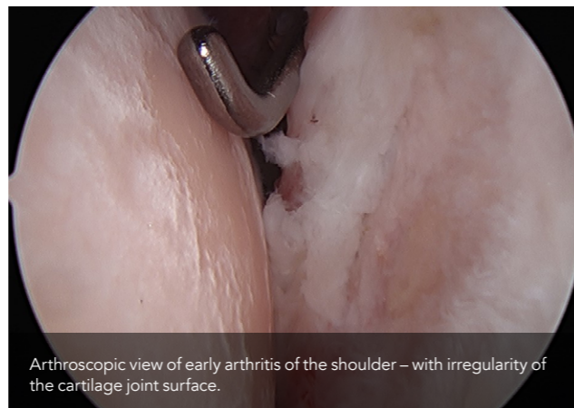
Arthroscopic view of early arthritis of the shoulder – with irregularity of the cartilage joint surface.