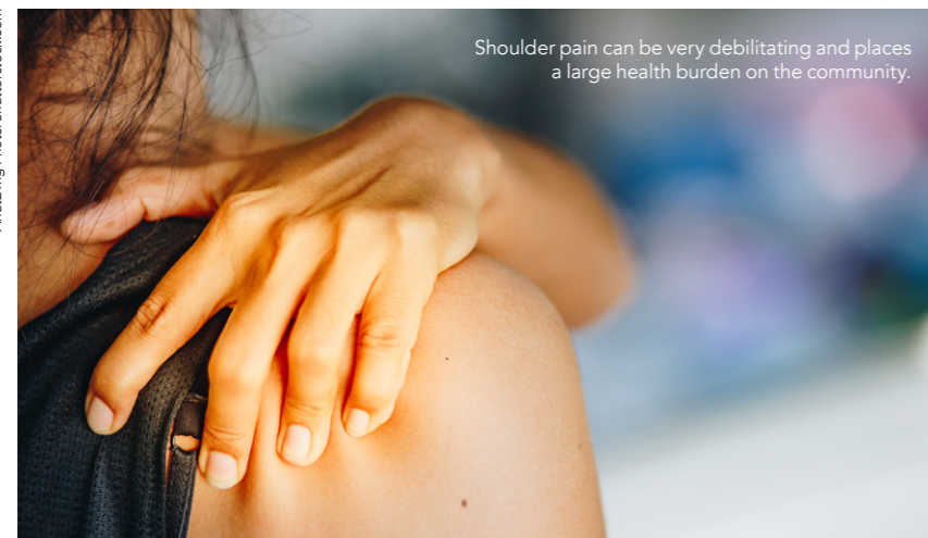
Shoulder pain can be very debilitating and places a large health burden on the community.

These studies recruit from a surgical cohort and involve the collection of tissue normally excised and discarded at surgery, as well as blood and urine samples. Collecting the samples during surgery eliminates additional injury or discomfort to participants. These studies will increase knowledge