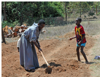
Self-sustaining project of the Franciscan Friars of the Pomerini Village, Tanzania.

Whereas humanitarian aid or disaster relief have very easy and clear cut relationships between donor and recipient, developmental aid is far more complicated. Cultural differences and misunderstandings can cause great difficulties in completing these kinds of large-scale construction or infrastructure projects, and when "ownership" of