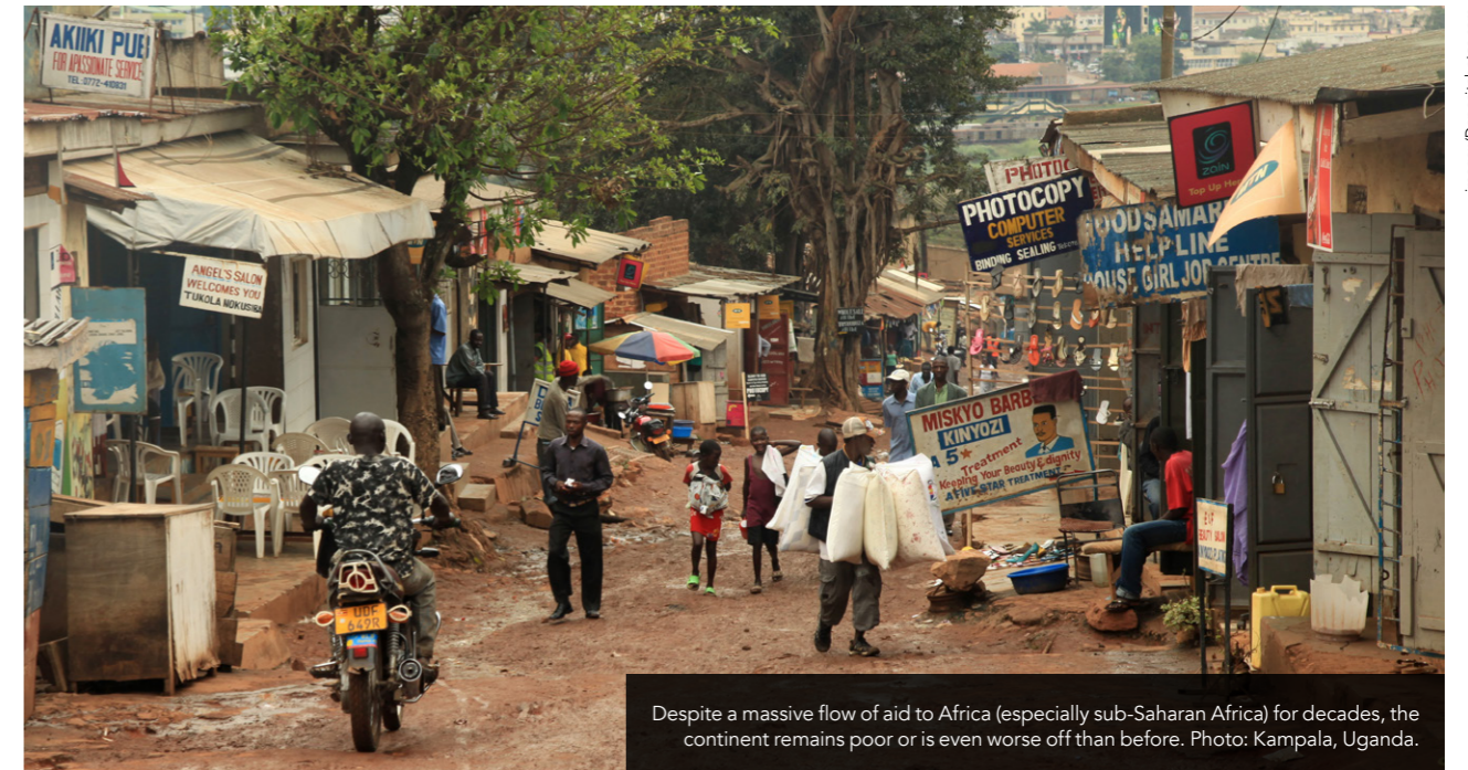
Despite a massive flow of aid to Africa (especially sub-Saharan Africa) for decades, the continent remains poor or is even worse off than before. Photo: Kampala, Uganda.

That's not to say there aren't opposing opinions. Strong advocates of foreign aid, such as Jeffrey Sachs, point out that it may be that foreign aid, especially in terms of humanitarian and health goals, has been a success, and indeed an increase of aid is what is needed if it could deliver sustainable