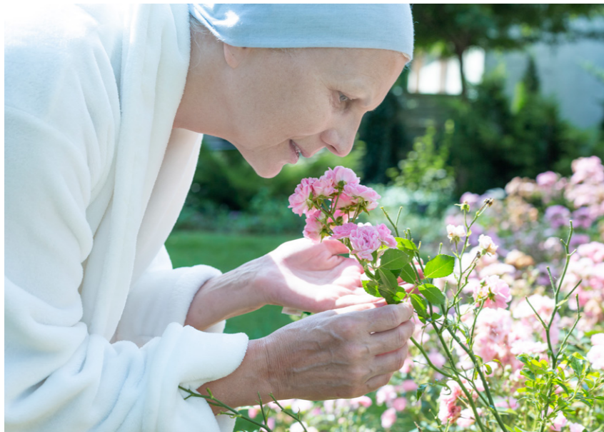
A holistic approach considers the human body and mind and situates it within the environment.