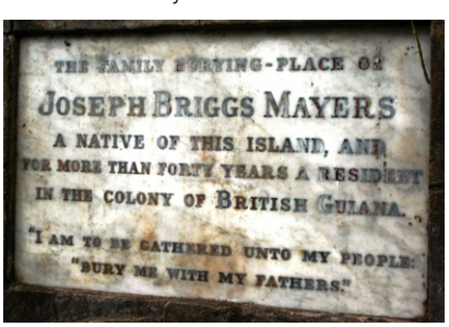
Irish name on a tomb stone at St. John Parish Church in Barbados.