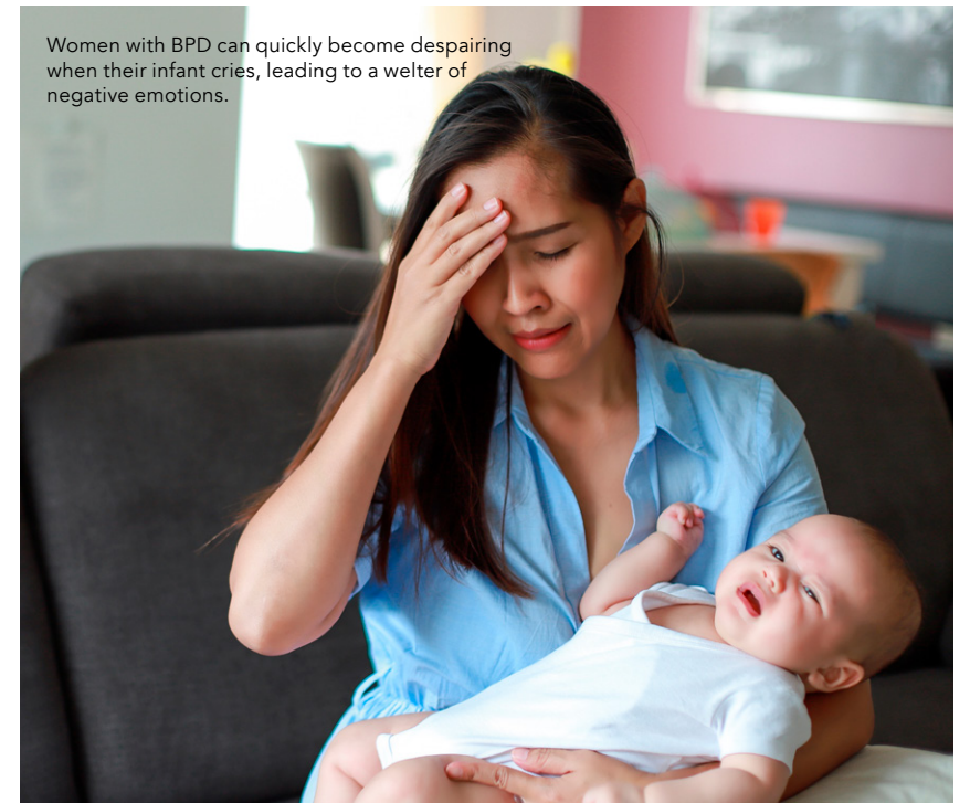
Women with BPD can quickly become despairing when their infant cries, leading to a welter of negative emotions.