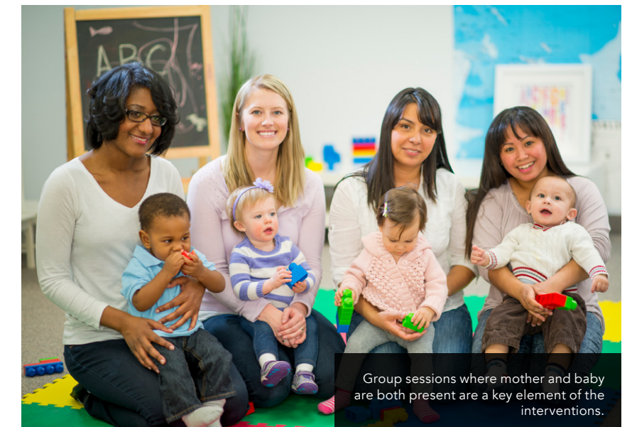
Group sessions where mother and baby are both present are a key element of the interventions.

the absence of those which involve therapy with both mother and baby, the team has embarked on a new approach to tailor psychotherapy interventions specifically for this troubled group. A key aim of their initial research was to ensure mothers and