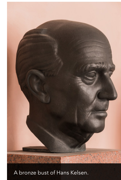
A bronze bust of Hans Kelsen.

Crucially, by assuming that the unanimity principle is the only limitation to the social contract, Buchanan ultimately fails to effectively constrain the law-making authority of political law-makers at the post-constitutional stage of the political process.