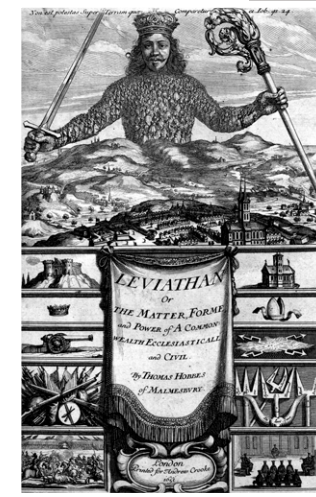
Leviathan and its author Thomas Hobbes.