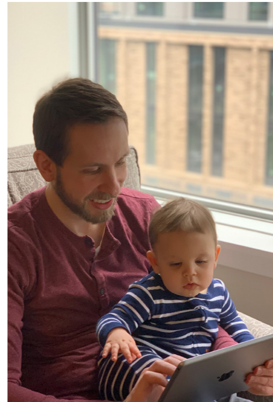
ReadAskChat embraces the definition of engagement as the degree to which parents work with teachers as partners in their children's educational success.

ReadAskChat may also play a role in Special Education; supporting young mothers who are still in education themselves; and in volunteer tutoring programs. It may also help to address so-called "summer slide," a documented phenomenon in which children who are not actively occupied during the long holiday tend to lose some learning gains made during the previous school year.