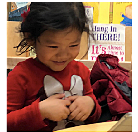
ReadAskChat offers an enjoyable, research-based method and digital tool to empower families to advance their young children's cognitive and social-emotional development.

educational experiences, achievement, and opportunities persist, even in developed countries like the U.S. and U.K. Too many children start school below grade level norms, and the majority of those children end up staying behind throughout their schooling. But an influential 2018 study at the Massachusetts Institute of Technology found that family language that includes "conversational turns" of the kind fostered by ReadAskChat accounted for significant differences in brain physiology and increases in language skills among children exposed to such conversations. These findings are particularly encouraging because they pertained to children regardless of parental income or education.