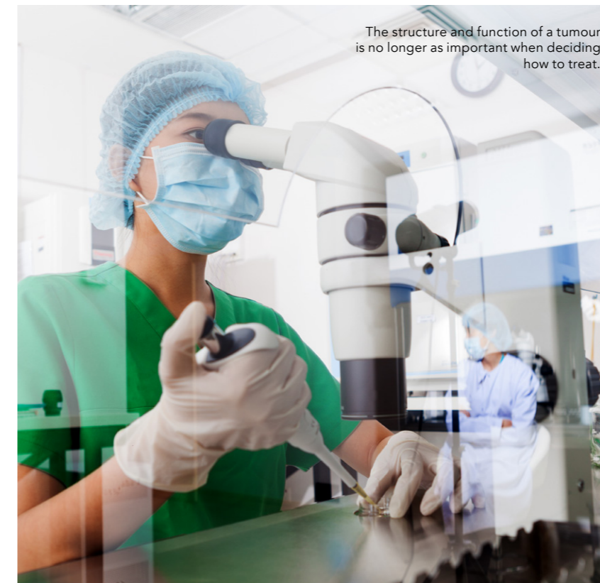
The structure and function of a tumour is no longer as important when deciding how to treat.

Until thirty years ago, knowledge of tumours mostly consisted of observations about the behaviour of tumour cells: it was known that tumour cells divide faster than most normal cells, that they are able to migrate and invade normal tissues, that they can evade recognition and destruction by the immune system, and that they seem to evade normal mechanisms of cell death – senescence and apoptosis. Therapies developed back then were ‘cytotoxic’ drugs whose cell-destroying actions were largely based upon the observation that cancer cells divide more rapidly than most normal cells in the body. This property provided a minimal amount of selectivity of the cytotoxic agent for the cancer cell over the normal cells. Of course, normal cells that divide rapidly, such as cells in the bone marrow and gastrointestinal tract, have very little protection from the cytotoxic agent, causing serious side effects. Starting in the late 1980s, however, there was an explosion in the understanding of the molecular lesions that cause and maintain the tumour’s unique characteristics. This molecular understanding has resulted in the