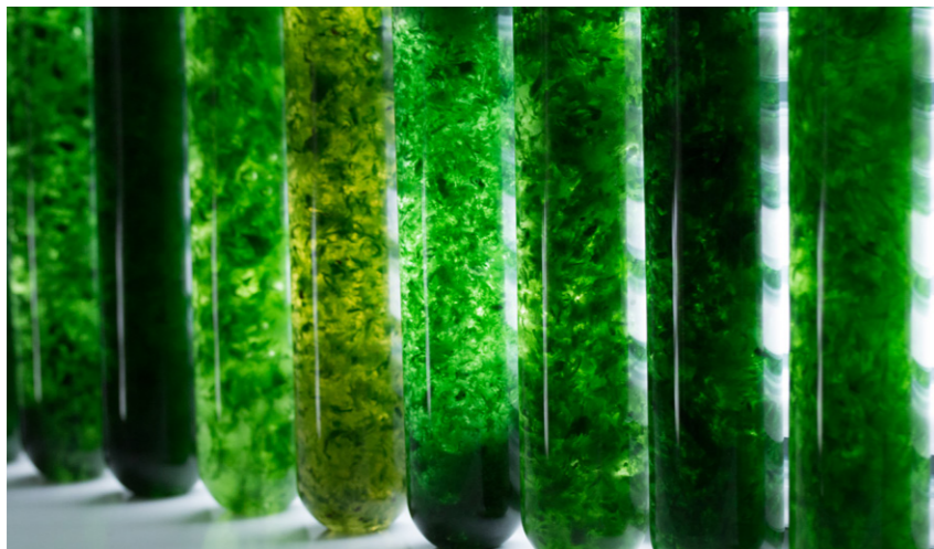
The researchers tested the interactions of several Nostoc strains in laboratory conditions.