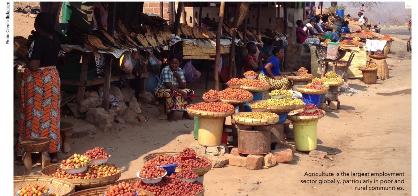
Agriculture is the largest employment sector globally, particularly in poor and rural communities.

Communities which still depend on or make use of forest and tree ecosystems have been shown to have a greater dietary diversity. Where indigenous communities have moved away from traditional diets towards a narrower range of foods, and often higher levels of fat, sugar, salt and refined carbohydrates, research has shown associated increases of non-communicable diseases like cardiovascular disease and diabetes. Over two billion people are estimated to suffer from deficiencies in essential vitamins and minerals, known as 'hidden hunger', which also leaves them more susceptible to disease.