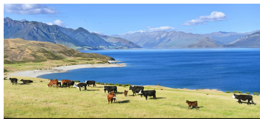
Cows with lower MUN breeding values had the same milk yield as cows with a higher MUN, yet the milk produced had greater levels of milk protein when compared to cows with a higher MUN.

...low MUN cows are a viable animal-based solution to reducing N losses from grazing based production systems to the environment.