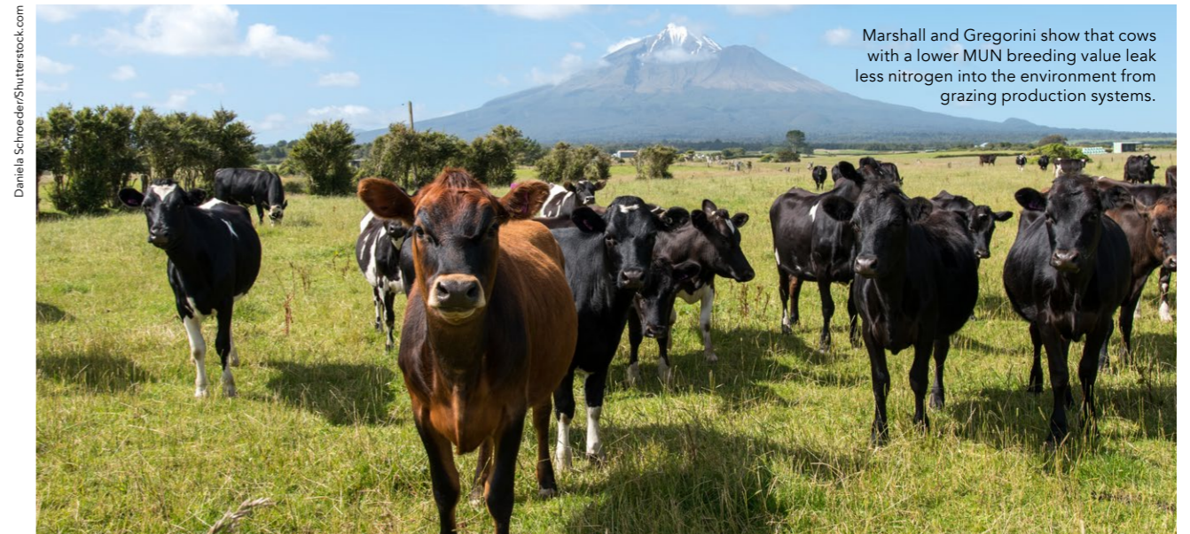
Marshall and Gregorini show that cows with a lower MUN breeding value leak less nitrogen into the environment from grazing production systems.

of the United Nations sustainable development goals including 6 (Water quality), 9 (Industry innovation), and 12 (Responsible production).