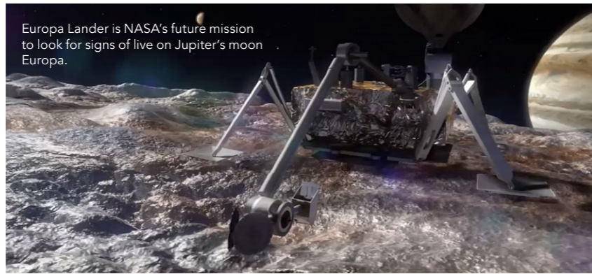
Europa Lander is NASA's future mission to look for signs of life on Jupiter's moon Europa.

Mars and the two moons Enceladus and Europa are all target planetary bodies where missions are considered Category III, IV or V. They are some of the most likely candidates to have life, or to hold clues as to how life evolved and was distributed within our solar system. Earth's space agencies, such as NASA, are working towards sending humans to