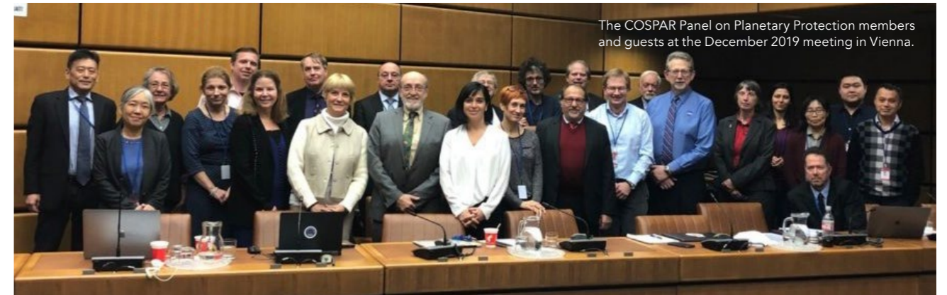
The COSPAR Panel on Planetary Protection members and guests at the December 2019 meeting in Vienna.