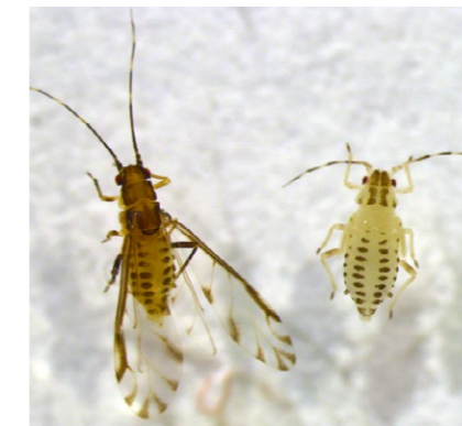
Salt stress in Lime trees affect the associated arthropod community.

de-icing salt are found to accumulate in leaves, causing necrosis that eventually seriously damages these trees. In comparisons with other central European species, T. cordata and T. platyphyllos , the researchers found that T. x vulgaris was the most tolerant. It had the least symptomatic