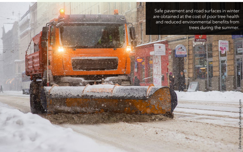
Safe pavement and road surfaces in winter are obtained at the cost of poor tree health and reduced environmental benefits from trees during the summer.