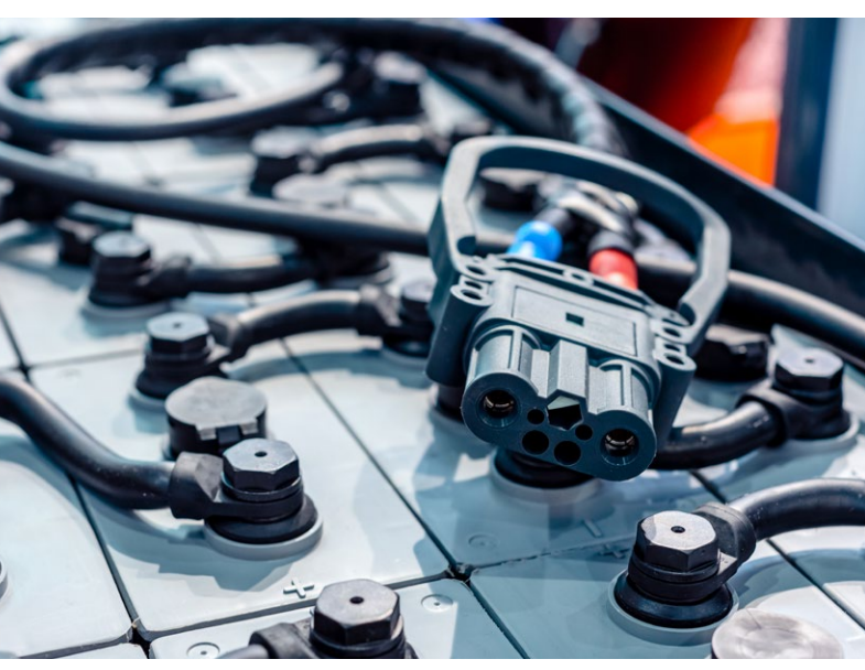
For our world to run on renewables, new technology is required which can store energy from intermittent renewable sources.

shuttling. Instead of modifying the electrodes, their work involves modifying the electrolyte which is sandwiched