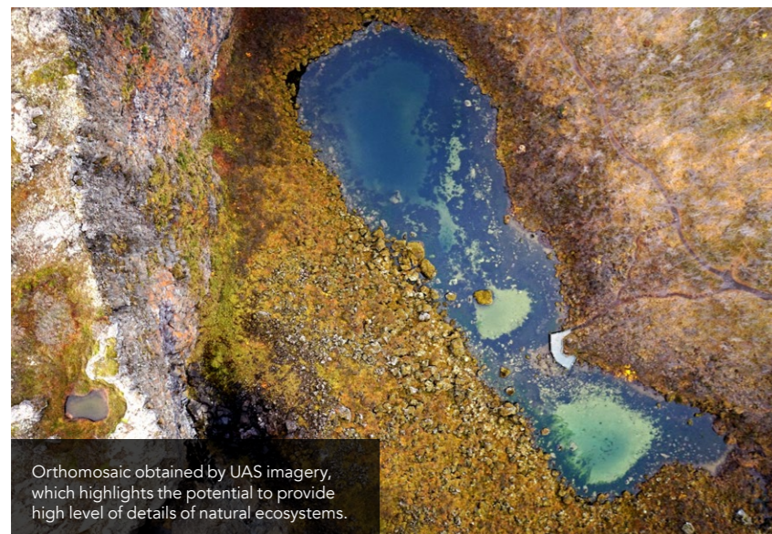
Orthomosaic obtained by UAS imagery, which highlights the potential to provide high level of details of natural ecosystems.

Following the pre-flight, the workflow explains how to safely and most effectively conduct the flight itself. The challenge at this stage is to account for the weather accurately. Wind speed,