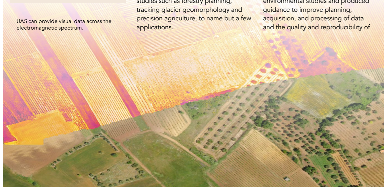
UAS can provide visual data across the electromagnetic spectrum.

research. They created a generalised workflow methodology with five interconnected steps: 1) study design; 2) pre-flight fieldwork; 3) flight mission; 4) processing of aerial data; and 5) quality assurance.