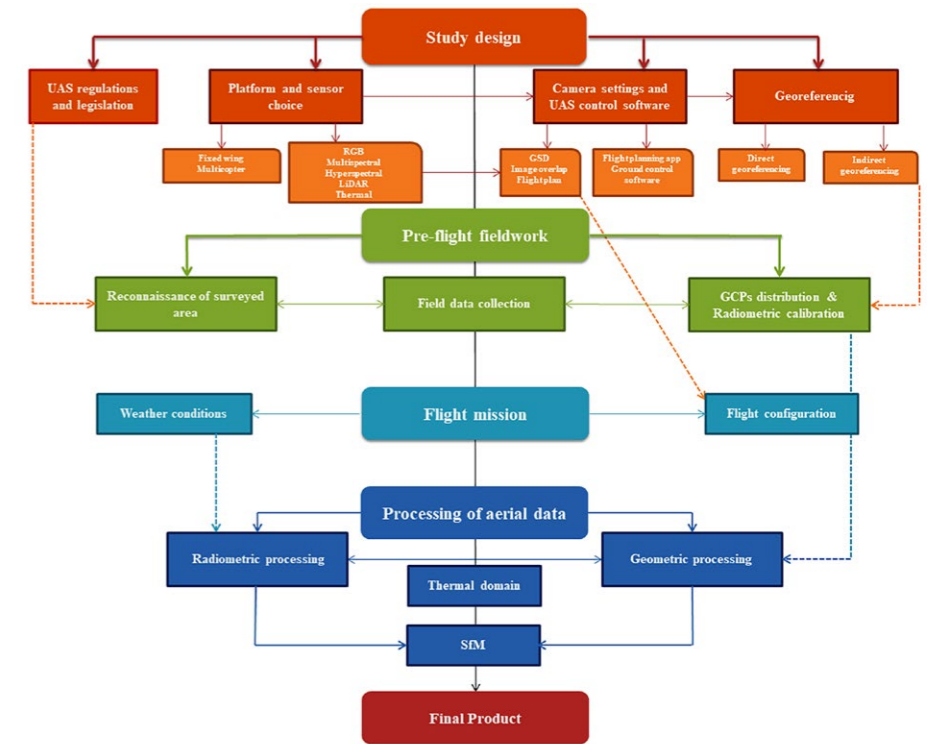
Workflow: Each mission requires a bespoke study design. Then, a pre-flight study takes place before the flight mission. The final stage describes how to best process the imagery and data from the flight.

Every UAS study can vary greatly and therefore requires a bespoke study design to set out a detailed mission