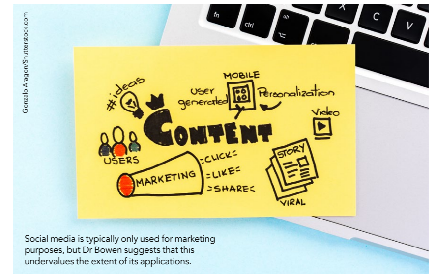
Social media is typically only used for marketing purposes, but Dr Bowen suggests that this undervalues the extent of its applications.