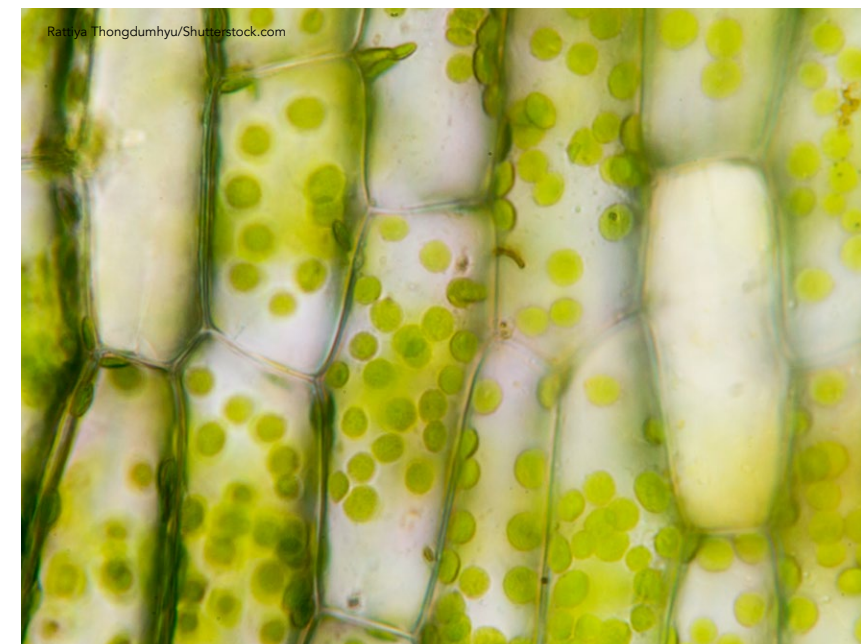
From an economical point of view, having longer jute fibres that are less stiff would enable better and more diverse jute products to be manufactured.