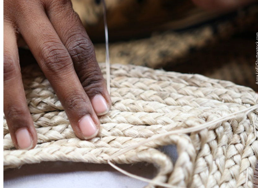
Jute is used for the manufacturing of various fibre-based goods.

The vascular tissues are comprised of a specific type of cells called sclerenchyma cells that make these tissues tough, thereby enabling their supporting and conducting functions. Sclerenchyma cells are elongated with tapering ends and have thick cell walls full of lignin (a polymer). The function of the cell wall is to offer shape and protection to the plant cell. Cell walls are made up of several chemical compounds, including carbohydrates such as cellulose, hemicellulose and pectin. Cell walls can be primary, which are thin, flexible, and formed during cell growth; in contrast, secondary