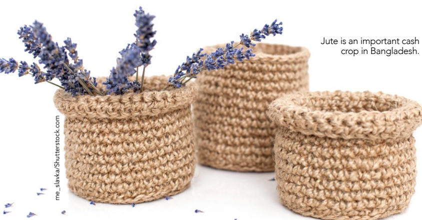
Jute is an important cash crop in Bangladesh.