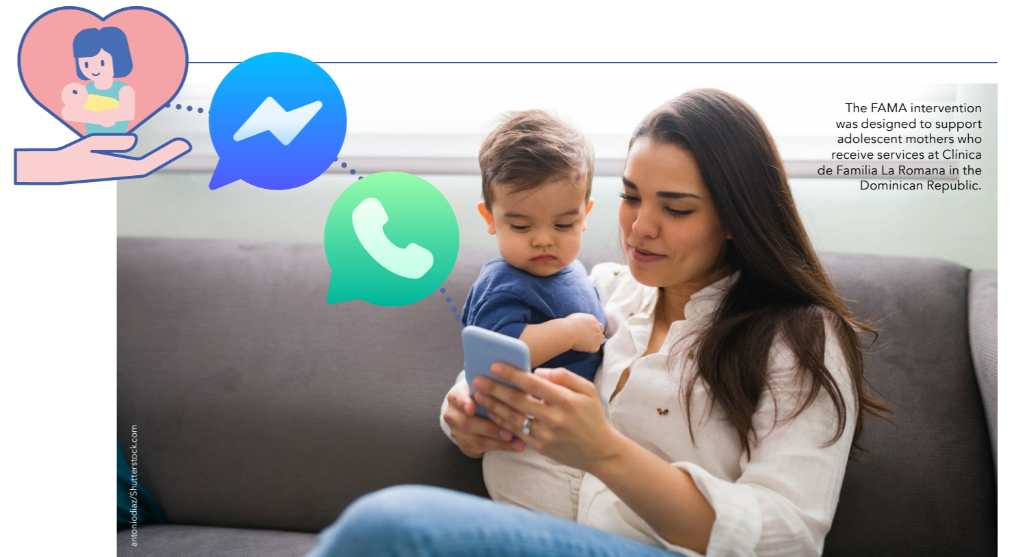
The FAMA intervention was designed to support adolescent mothers who receive services at Clínica de Familia La Romana in the Dominican Republic.

Adolescent mothers in the Dominican Republic do not always have access to social or family support after they give birth and there is often a deep need for information on how to care for their new baby, and especially on specific topics such as breastfeeding. Having access to the right information at the right time can positively impact the care young mothers