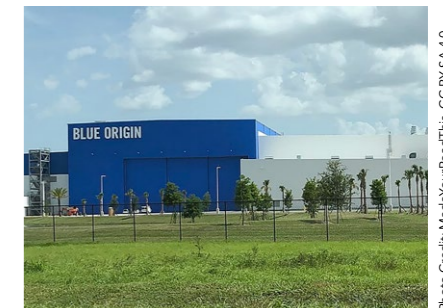
Blue Origin Facility.