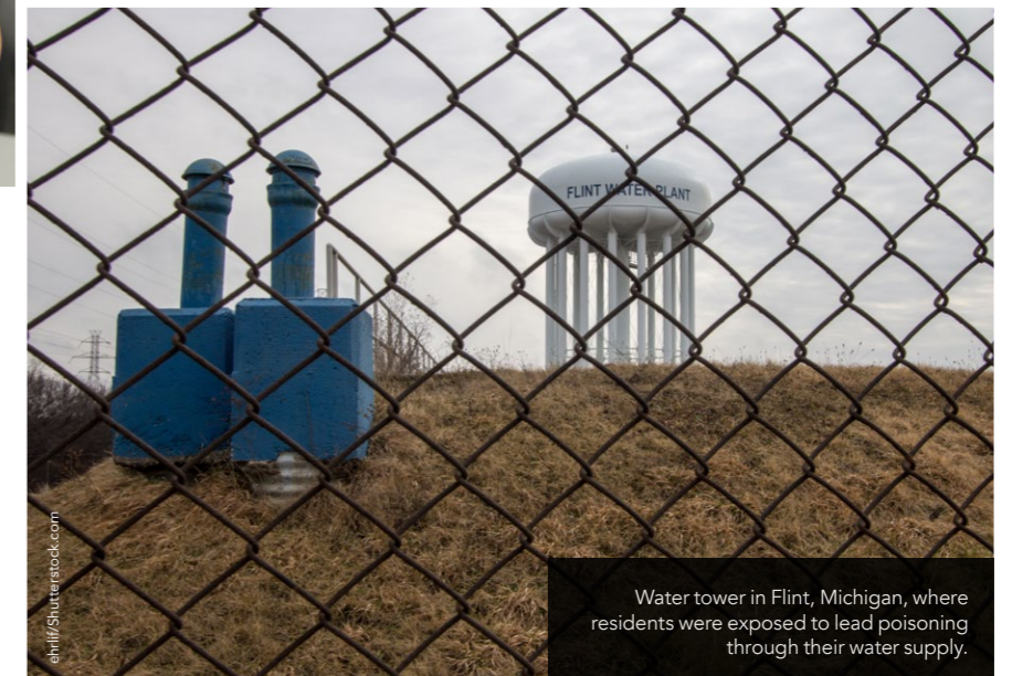
Water tower in Flint, Michigan, where residents were exposed to lead poisoning through their water supply.